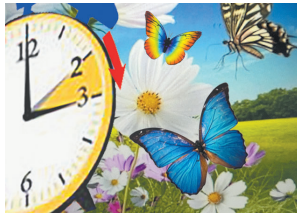
El 10 de marzo adelantaremos una hora.

Por el contrario, este cambio de horario terminará el domingo 3